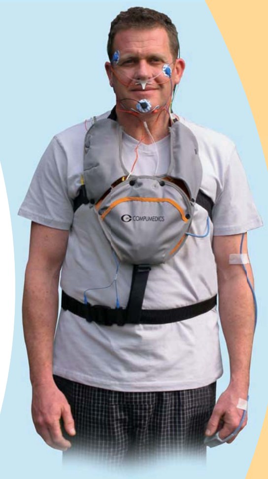
Optional EZ Vest for use with Somté PSG

Somté PSG System Part Number: 9023-0002-01