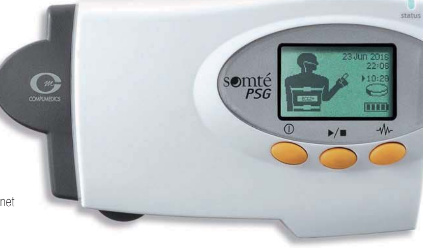
Pictured actual size