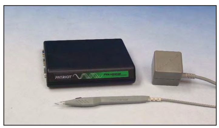
Standard PATRIOT Digitizer includes TX2 Source, 8" stylus (shown above) and foot/hand switch (as seen on the back page)